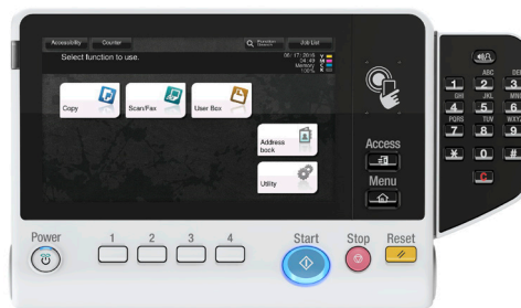
Innovative 7" Multi-touch Display Panel with NFC authentication area and optional Keypad (KP-101)