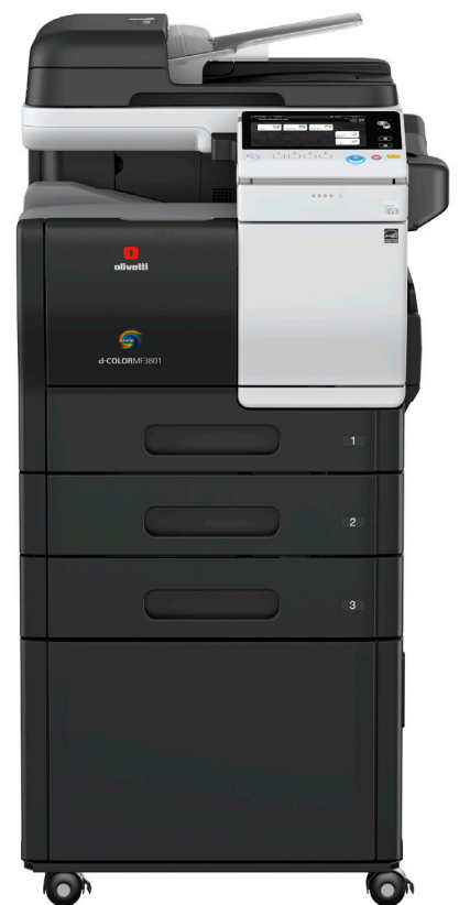
Configuration with 2 optional Paper Drawers and Copy Desk